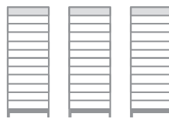
32 x LITEIN 82.5